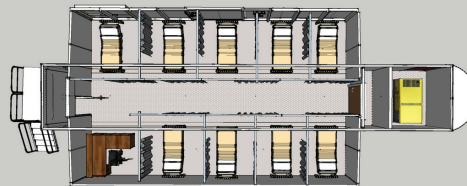
sample floor plan 9 bed unit